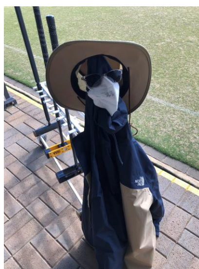
Found an unexpected Spectator watching the men play in the Brighton Armstrong Challenge